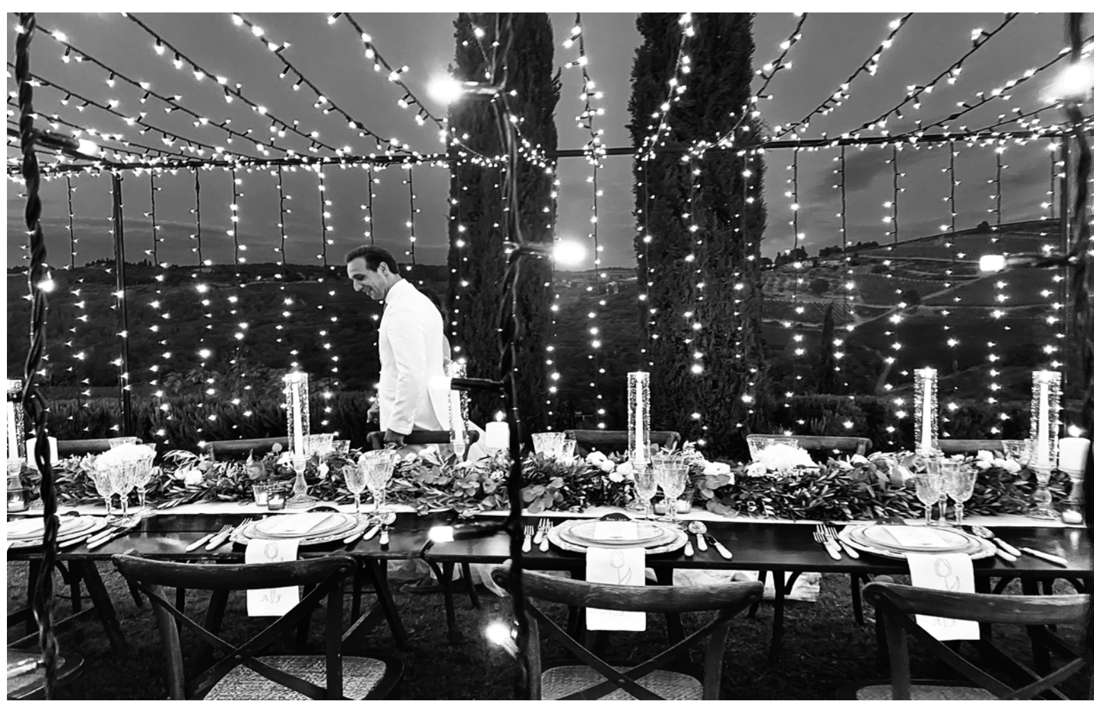
A CHIANTI WEDDING AT RIGNANA ESTATE